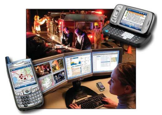
Figure 3: Visual analytics supports emergency responders in the office and in the field.

Visual analytics for law enforcement A central challenge in visual analytics is the creation of accessible, walkup-usable, widely distributable analysis applications that bring the benefits of visual discovery to as broad a user base as possible. The Scalable Reasoning System (SRS)9 provides web-based and mobile interfaces for visual analysis through a service-oriented analytic framework