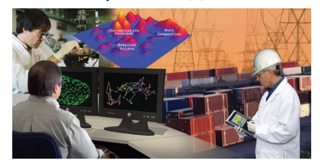
Fig 1. National Visualization and Analytics Center

The information visualization deals with heart of nature known as interaction on the dataset. Interaction allows users to dynamically change the mapping of the data (Eg: Color, Shape, Size), the view of the mapping (eg: zoom, pan, rank) or the scope of the data being visualised (Eg: search, Filter) [2]. Visualization and visual analytics show great potentials as methods to analyze, filter, and illustrate the vast sea of electronic data and interprets the volume of data [3]. There are multiple techniques has involved to evaluate the informatics data and to the development of an evaluation methodology for visual analytics environments. The Visual Analytics Science and Technology Challenge was created as a community evaluation resource which helps to test out their designs, visualisation and compare the results [4].