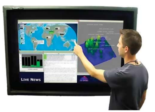
Figure 5: The Assessment Wall consists of linked interactive visualizations for streaming text documents on a high resolution touch-screen interface.

Large interaction displays provide opportunities for colocated synchronous collaboration by providing groups of people with walkup interfaces. Large interactive displays can also be designed as ambient information portals providing casual access to continually updated information through robust analytical capabilities usable by individuals and groups alike. Ambient displays located in gathering locations such as kiosks have been used for many years to provide vital information. This concept was expanded in a technology called the Assessment Wall to incorporate visual analytics techniques in appealing, walkup appliances, offering real time multiple source situation assessment.