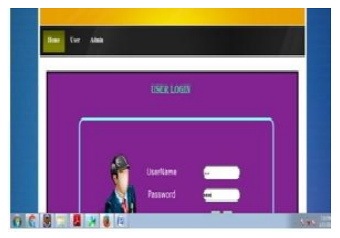
Figure 1: user login process