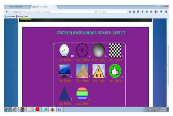
Figure 2: image ranking process