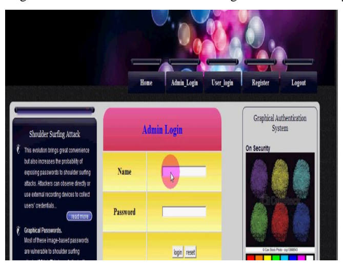
Figure 3: Admin login process