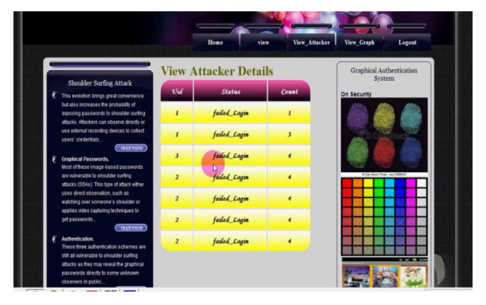
Figure 4: Then know the attacker details after the process of admin login