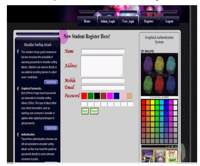
Figure 1: This is the new registration process

Then the results of the implementation of graphical authentication system to resistant shoulder surfing attacks