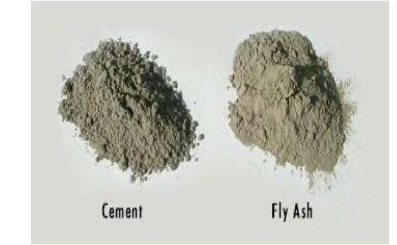
Figure 1: Cement vs Fly Ash

Initially properties of fly ash will not same always, because fly ash collected from coal fired thermal power plants gets differ. Due to temperature range at which coal was burned and also burning process of coal plant has an impact on the fly ash properties at coal-fired power. The burning of coal at cement plant and thermal power plant gets differ which leads change in properties. The dielectric constant of fly ash is never the same. Due to the temperature and humidity most of the fly ash changes occur commonly. Then the fly ash collected from the heavy oil or waste burning installation process also naturally will have different properties as well. Important properties of fly ash are weight of the fly ash, temperature, dielectric constant, size of the particles, and how sticky is it.