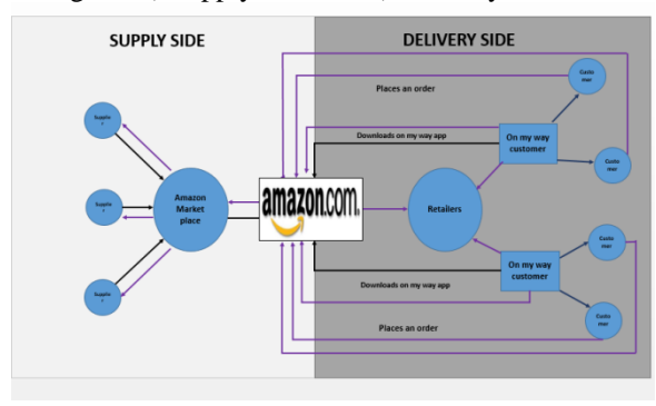
Figure 2: Chart showing supply and delivery side of Amazon.com

Amazon, the American online supermarket company integrates the concept of crowdsourcing very well in to their business operations. The business model of Amazon can be classified in to two stages – a) Supply side and b) Delivery side