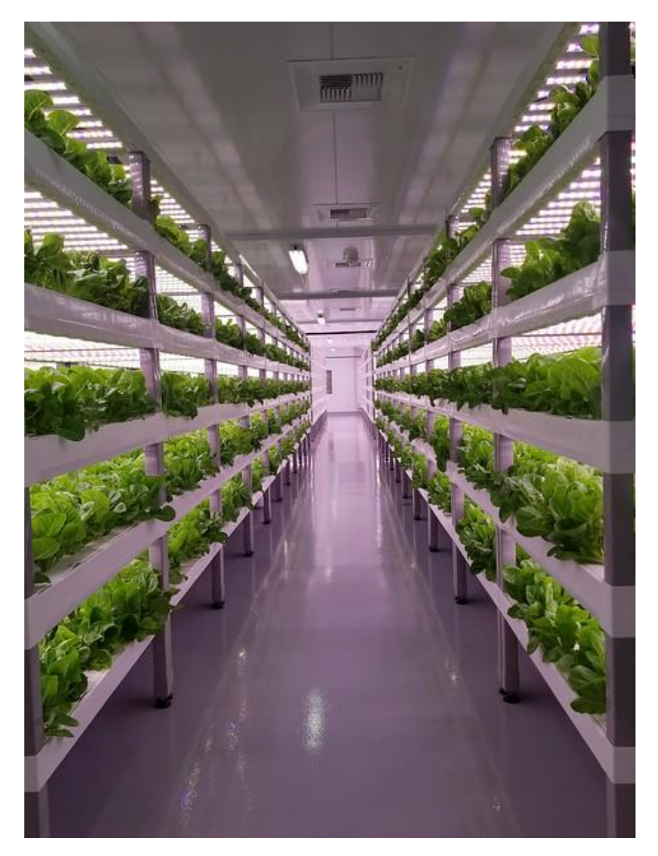
Figure 1: A typical vertical farming [2].

Vertical farming, also known as indoor farming or farming upward, is the practice of producing food on vertically inclined surfaces in a high-rise building or repurposed warehouses in the urban centers. It involves growing fruits, vegetables, and other crops in cities on vertically stacked layers in an enclosed environment. Vertical farming can provide access to fresh and safe food, independent of climate and location. It allows you to grow and harvest crops year-round, anywhere in the world. It can produce more food from less land and water than traditional farming. It also drastically reduces waste and usage of chemical fertilizer. Figure 1 shows a typical vertical farming [2].