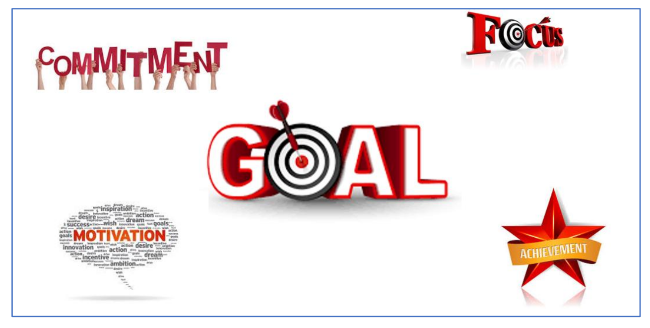
Figure 4: Goals

This indicates that there is a strong connection between commitment, motivation, focus, goals and achievement. If you lack commitment to a goal, you lack motivation to reach them. Goals can serve as a central core which can help you focus and manage your time and resources to achieve it.