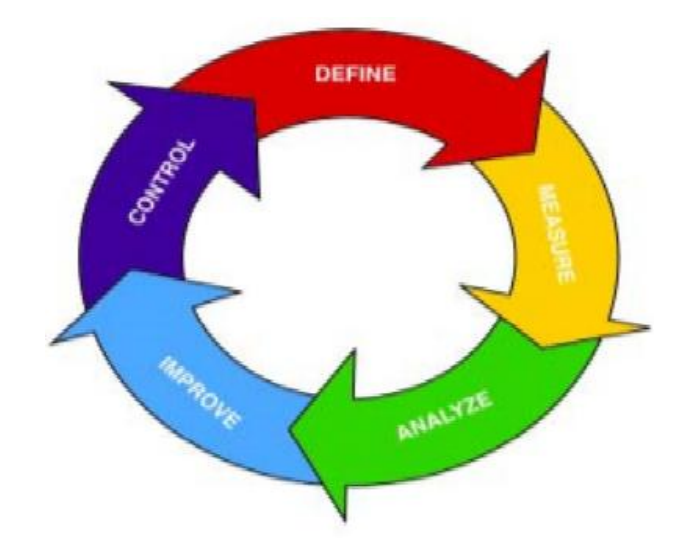
Figure 3: Six Sigma cycle for process improvement [13].

Lean process involves the removal of activities that are not necessary or required for the operations of the business. The