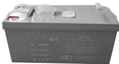
Fig 3. GJ12-200 V 200Ah Battery

The selected battery is 12 V GJ12-120 AGM lead acid battery, 2000 Ah. This battery has a length of 520 millimeters, width of 240 millimeters and height of 245 millimeters.