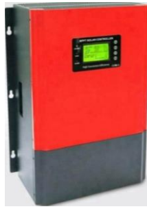
Fig 2.Solar Charge Controller

The solar charge controller should be rated at 70 A and 220V or greater. Therefore, the charge controller with maximum charging current of 100A shown in fig.2 is selected. The following Table 2 shows parameters of charge controller.