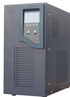
Fig 1. Single phase 20 kW 220V DC-AC inverter

The inverter size should be 25 to 30 percent bigger than total watts of appliances. For off-grid systems, the input rating of the inverter should be the same as PV array rating to allow for safe and efficient operation. In this design calculation of off-grid PV system with battery storage, DC/AC inverter 20kW, and 220V off-grid AC inverter shown in fig.1 is selected. So, the inverter size can be used above 20kW of greater. Table 1 shows specification of solar power inverter.