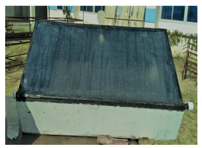
Figure1: Solar Still Distillation

This device is known as TDS meter which is generally used to check impurity level in water with temperature. This indicates the total dissolved solids (TDS) of a solution i.e. the concentration of dissolved solids particles. Dissolved ionized solid such as salt and minerals increase the electrical conductivity (EC) of a solution, because it is a volume measure of ionized solid, EC can be used to estimate TDS. Dissolved organic solids such as sugar in microscopic solid particles such as colloids', do not significantly affect the conductivity of a solution and are not taken into account.