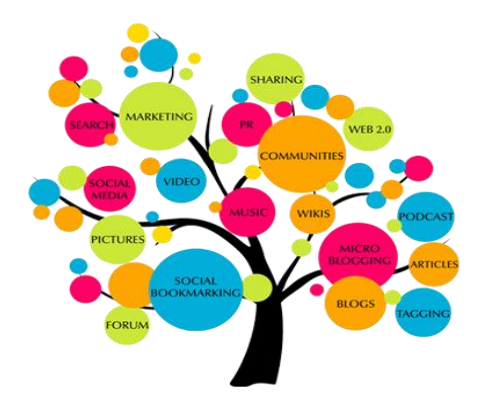
Fig 1.5 the picture tells the various ways of spreading the website

About increasing back links with an intention to increase the value of the site, While most of the links to the site will begained gradually, as people discover the content through search or other ways and link to it, Google understands that the users would like to let others know about the hard work the webmasters have done in the content. Effectively promoting the new content will lead to faster discovery by those who are interested in the same subject, as with most points covered in this document, taking these recommendations to an extreme could actually harm the reputation of the site