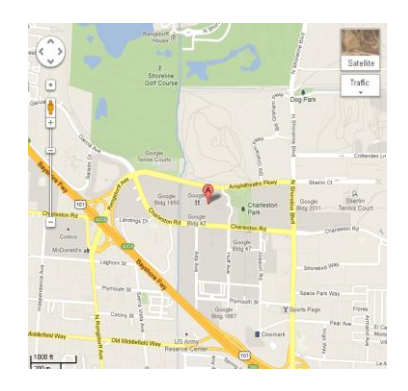
Fig 1.16 the picture tells about the location (site map) of a particular website

Configure mobile sites so that they can be indexed accurately