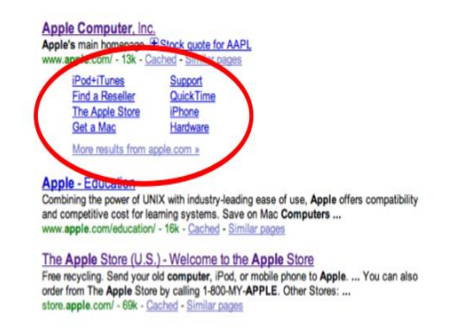
Fig 1.3 the picture rounds up the anchor text which shows some of the other links pointing to the internal page of that particular website.

pointing to other pages on your site—or external—leading to content on other sites. In either of these cases, the better the user's anchor text is, the easier it is for users to navigate and for Google to understand what the page the users linking to is about