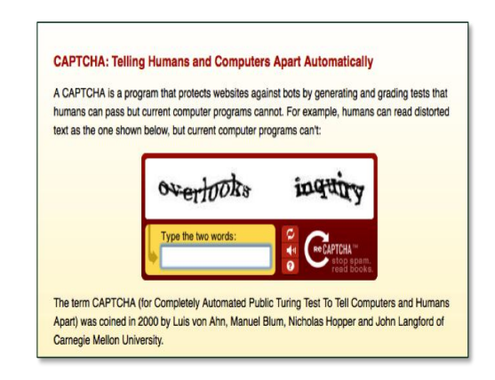
Fig 1.17 the picture displays a CAPTCHA image that will protect the website.

Many blogging software packages automatically no follow user comments, but those that don't can most likely be manually edited to do this. This advice also goes for other areas of the site that may involve usergenerated content, such as guestbook, forums, shout boards, referrer listings, etc. If the user is willing to vouch for links added by third parties, then there's no need to use no follow on links; however, linking to sites that Google considers spam can affect the reputation of your own site. The Webmaster Help Center has more tips on avoiding comment spam, like using CAPTCHAs and turning on comment.