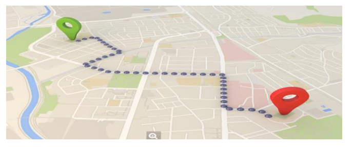
Fig 3: Daily mobility pattern of an individual illustrated by a sequence of space – time Coordinate points (x, y, t)