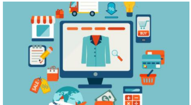
[Figure 4. New Research: Cisco Reveals the Current state of Digital Transformation in Retail. The Americas Network. 17 January 2017. Image downloaded from:

https://americas.thecisconetwork.com/site/content/lang/en/id/6909 ]