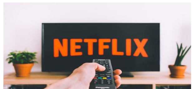
[Figure 2. Digital Disruption and TV Ad Buying. The Boston Group. 27 June, 2018. ]

Curated Content Is More In Demand: - The audience is continuously changing and so are their demands. Curated content is more in demand. And the trend isn't dying any soon. It has been observed that media giants like Netflix and Amazon have already been effectively using the curated content for years. Curated content is where the platform suggests what the audience would like to watch. When used effectively, it can create newer and larger audiences instantly.