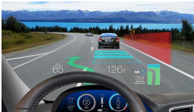
[Figure 3. True Augmented Reality. Automotive Chipsets-Applications. Texas Instruments.2018. ]