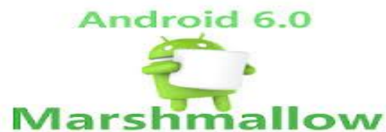
Figure 3: Android OS Version 6

6.0 (Marshmallow) is an upcoming update to the Android mobile operating system, most likely to be released in Q3 2015 ("tentatively slated for September"), with its third and final preview released on August 17, 2015. Marshmallow will primarily focus on improving the overall user experience, and will bring a few features such as a redesigned permission model in which applications are no longer automatically granted all of their specified permissions at installation time, Doze power scheme for extended battery life when a device is not manipulated by the user, and native support for fingerprint recognition.