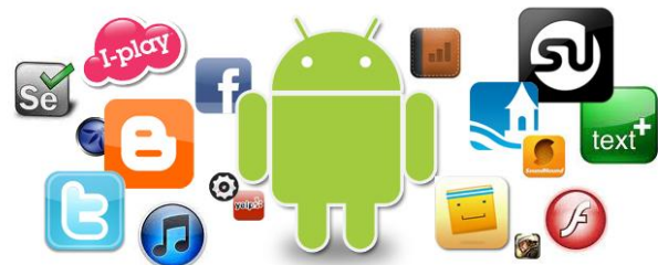
Figure 6: Android Application