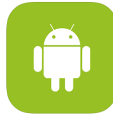
Figure 4: Logo of Android

it is essentially free for manufacturers to implement. Additionally this has led to substantial fragmentation of Android versions between devices and means that vendors have been reluctant to roll-out updates, presumably out of some concern regarding driving demand for future devices.