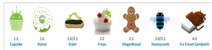
Figure 2: Different Version of Android OS

Android is updating day by day since its release. These updates to the base operating system mainly focusing on fixing bugs as well as adding new features to provide more comfortable environment. Generally each new version of the Android operating system is developed under a code name based on a dessert item. Past updates included Cupcake and Donut. The most recent released versions of Android are: